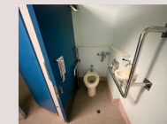
Restroom (First Floor)