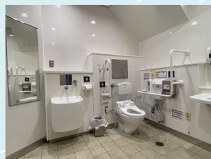
Wheelchair Accessible Restroom

The sidewalk in Kobe Sports Park Area (Kobe Undo Koen) is developed and is flat. However, there are some uneven roads (such as those that are uphill and diagonally sloped) in the southwestern part of the park. There are wheelchair-accessible restrooms at the station and the park. A toll parking lot is available in the park with disability discounts, and wheelchair parking lots are available near each stadium. There is Wi-Fi access at the station plaza and Kobe Green Arena.