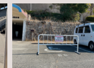
Parking Lot (P1)