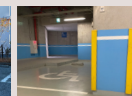
Parking Lot (Underground)