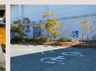
Parking Lot (P8)