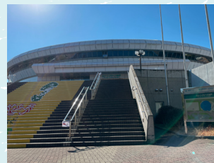
Kobe Green Arena