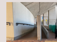
Ramp (Third Floor)