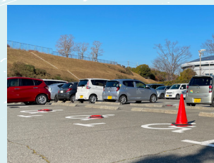
Wheelchair Parking Lot