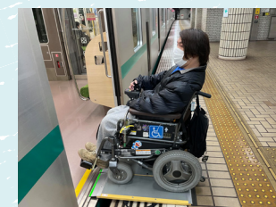
Portable Wheelchair Ramp

To get a discount, show your disability certificate to the station staff. Check the website for more details.