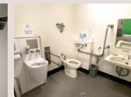
Restroom (Third Floor)