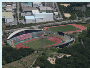
Universiade Memorial Stadium

Kobe Sports Park encompasses wide-ranging professional sports facilities for sports and international meetings. This includes the Universiade Memorial Stadium, which previously hosted the National Sports Festival of Japan, as well as a dome-shaped gym called Kobe Green Arena; all of which are enveloped in rich nature. Children, meanwhile, will be excited at the abundance of playground amenities installed in the parks. These are decorated with flowers for all seasons. It's the ideal venue for sports, outings and other leisure excursions. Pre-games training camps for the Olympic Games, basketball games and table tennis games of World Masters Games 2021 Kansai will be held at the Kobe Green Arena. Kobe 2022 World Para Athletics Championships will be held at the Universiade Memorial Stadium.