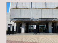
Entrance (First Floor)